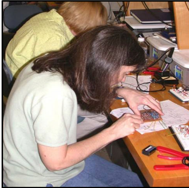
Figure 5. Basic electronics laboratory.

Teachers are very enthused about the hands-on nature of these laboratories, and they provide a good springboard to more advanced sensor research on bioengineering applications – for this year, the focus was on variable-rate technology and biosensors. Below is a list of the ten labs completed during the first two weeks of the summer program: