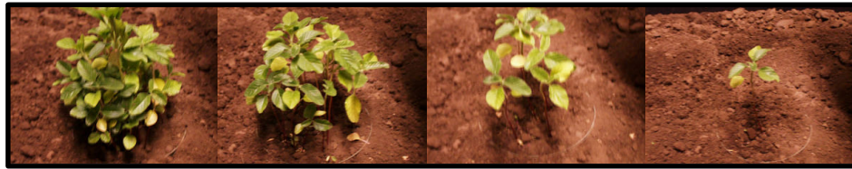
Figure 1. Redroot pigweed at different density levels.

rate planting, and yield mapping. For these applications, fast computation speed is always a central issue and is an excellent application of our research on hardware/software tradeoffs.