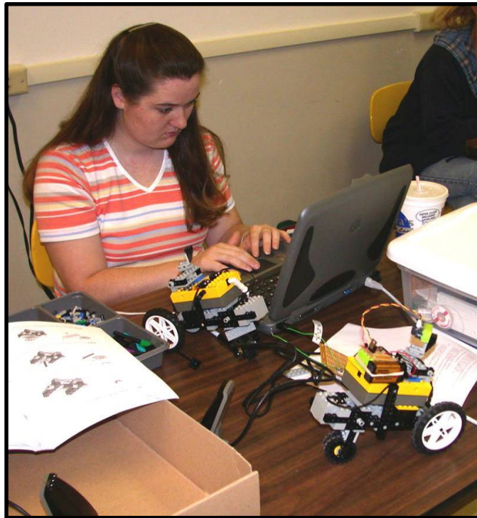
Figure 4. RET-Site teacher programming a robot with a custom distance sensor.

Designing and programming the robots naturally motivate both teachers and students to acquire a much deeper understanding of the underlying mathematics (including logic, geometry, algebra, and discrete mathematics), science (including measurement, the scientific process, and physics), and engineering. In addition to working on simple embedded control systems (using RIS 2.0) that they take back to their own schools, teachers also work with graduate research students and faculty members on more complex real-time embedded systems. In this way, they gain a deeper understanding of embedded system design and learn how to apply basic principles to more complex designs. For example, a typical complex application includes variable rate technology for use in an agricultural applications (see Figure 2).