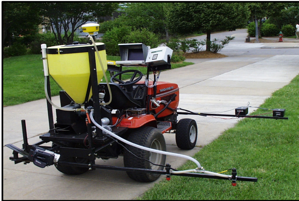
Figure 2. Weed detection system with variable rate applicator.

For example, one capstone project focuses on agricultural applications involving variable-rate technology (VRT). Infrared sensors are used to collect information (Figure 1). Then, distributed controllers evaluate the input and generate variable-rate application recommendations in real-time. All sensors, controllers, and actuators are networked together using a real-time controller area network.